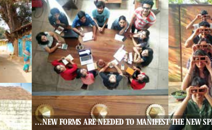
...NEW FORMS ARE NEEDED TO MANIFEST THE NEW SPIRIT