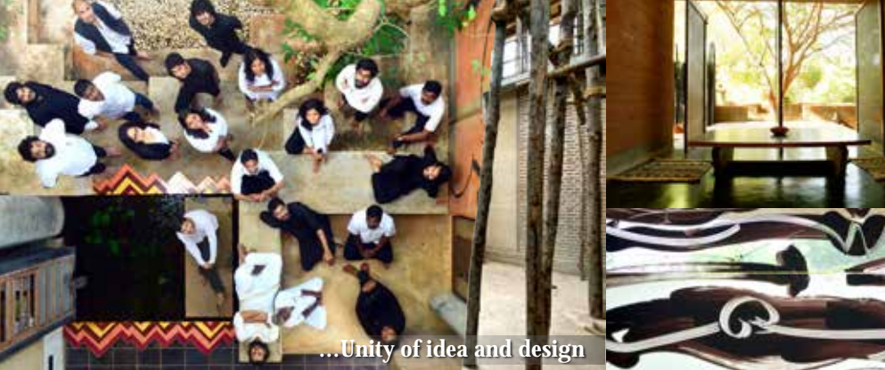
...Unity of idea and design